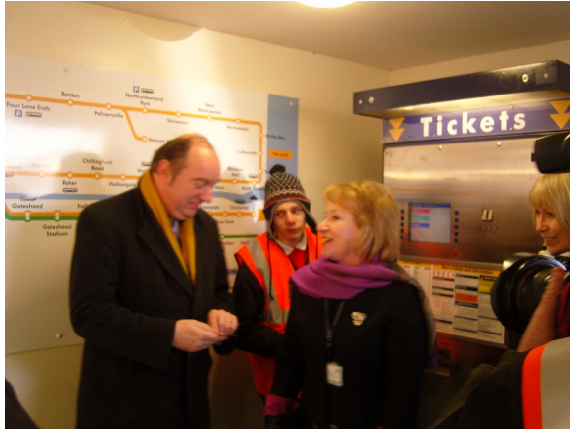
Transport Minister purchases Metro ticket with the Mayor of North Tyneside