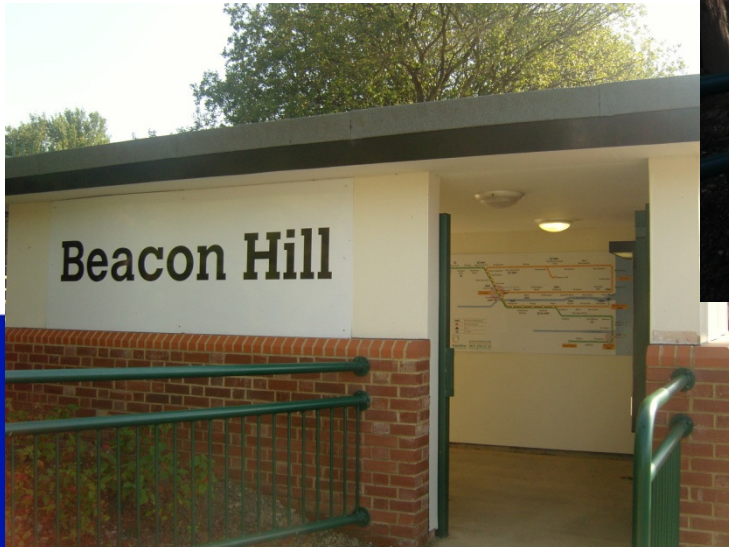
North Tyneside Council