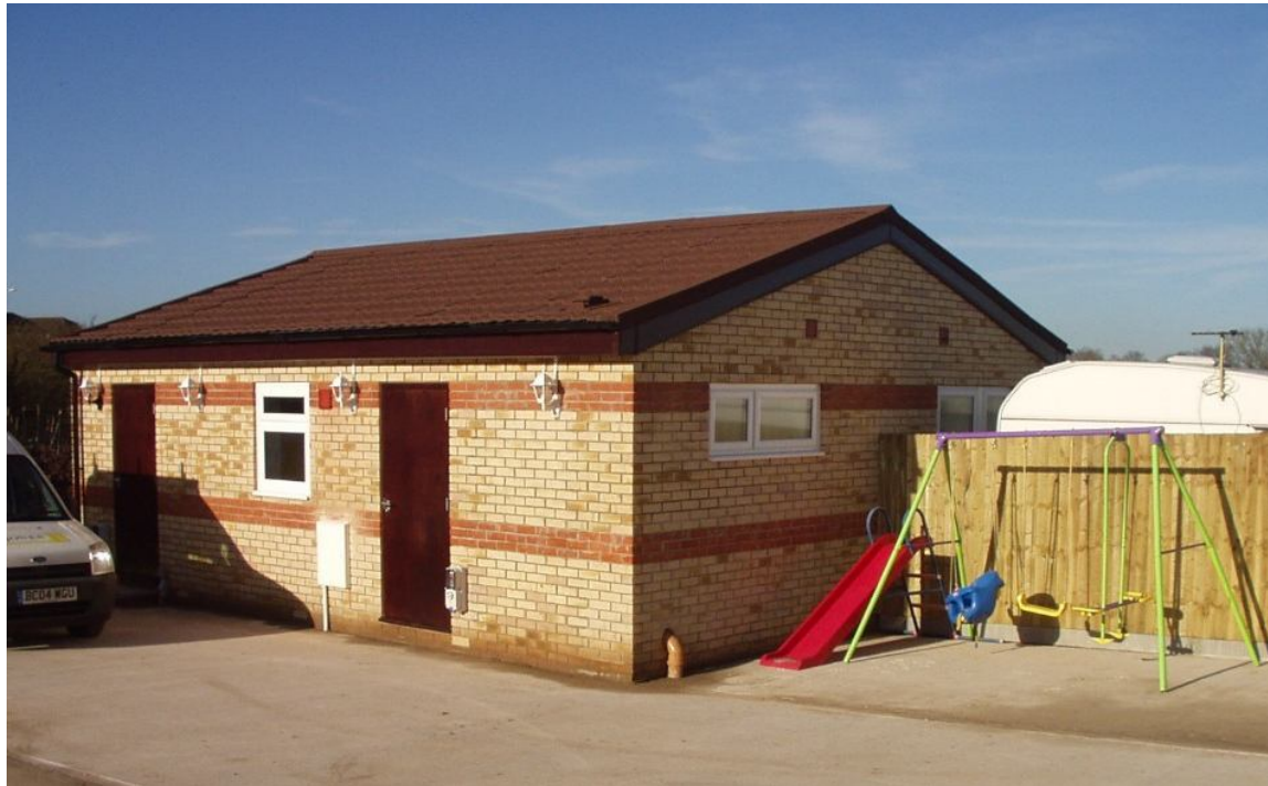
Northwood Park, Gloucestershire